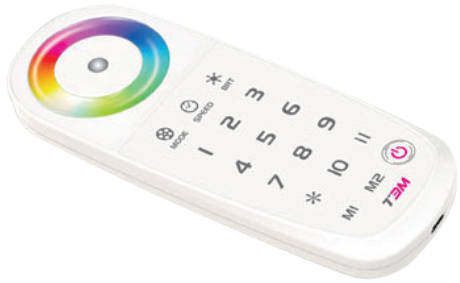
(1) RGB (REMOTE)